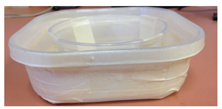
Figure 5. The rough-surfaced tape has been tightly wrapped around the large container. It is important that the tape is wrapped tightly and that there are not any cracks or crevices created where bed bugs can hide.

4. Glue the smaller container onto the center of the bottom of the larger container.