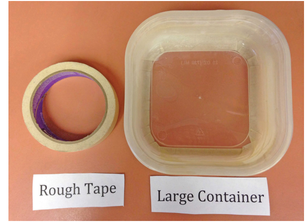
Figure 4. Rough-surfaced tape and a large container are needed for step #3.

3. Wrap the rough-surfaced tape around the exterior side of the larger container so that the entire outer surface is covered from the base to the upper edge of the container.