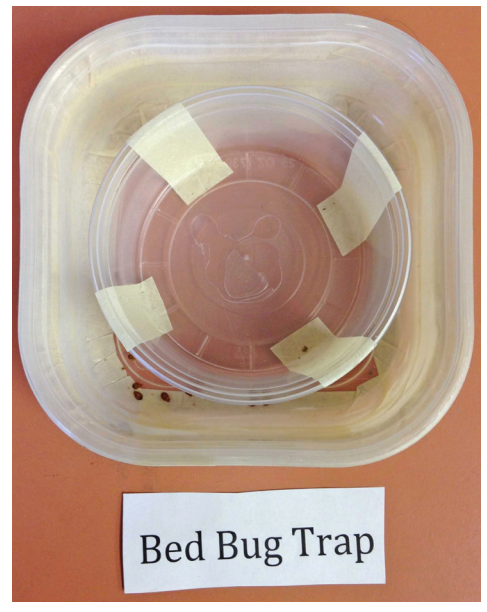
Figure 6. The small container has been glued inside the center of the large container. The walls of the containers should not touch.

4. Glue the smaller container onto the center of the bottom of the larger container.