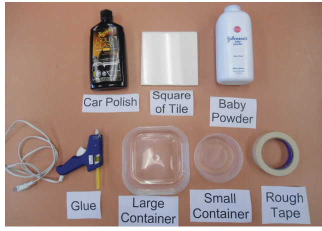
Figure 1. Items needed to make a single bed bug interceptor trap. From left to right and top to bottom: Car polish, square tile, baby powder, glue, large container, small container, rough-surfaced tape.