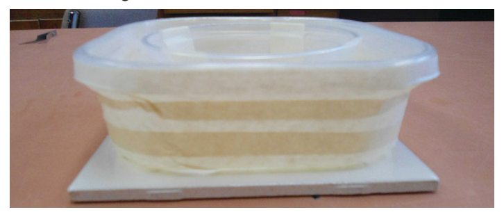
Figure 11. Square of tile placed underneath an interceptor trap.

Option : On carpeted floor, place a square of tile or plywood underneath the trap to prevent the trap from breaking under the weight of the furniture.