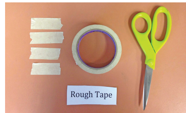
Figure 2. Four pieces of rough-surfaced tape cut to match the height of the wall of the small container.

1. Cut four pieces of rough-surfaced tape. The cut pieces should be at least as high as the wall of the smaller container.