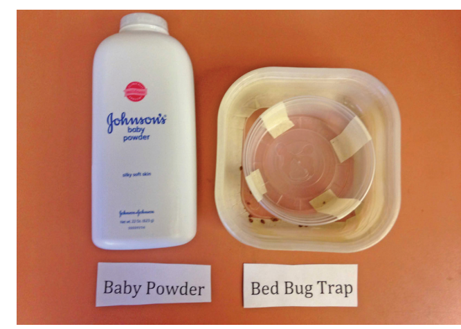
Figure 7. Baby powder and finished bed bug trap.

Option : Apply car polish or talcum powder to the interior side of the larger and exterior side of the smaller container. Follow the directions on the car polish bottle on how to apply and buff the product. If using talcum powder, do not touch the dusted trap surface with your hands. Talcum powder should be reapplied as necessary.