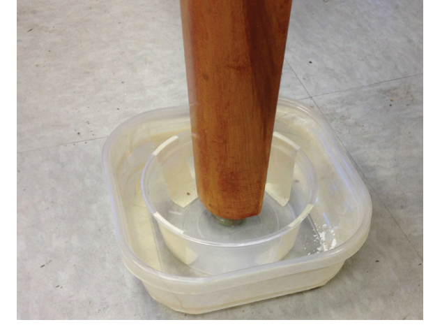
Figure 10. Interceptor trap placed under the leg of a piece of furniture.

6. Move the piece of furniture to be protected away from walls and other furniture, and place a trap underneath each of its legs. With beds, bedding should not be touching the floor, walls, or other furniture.