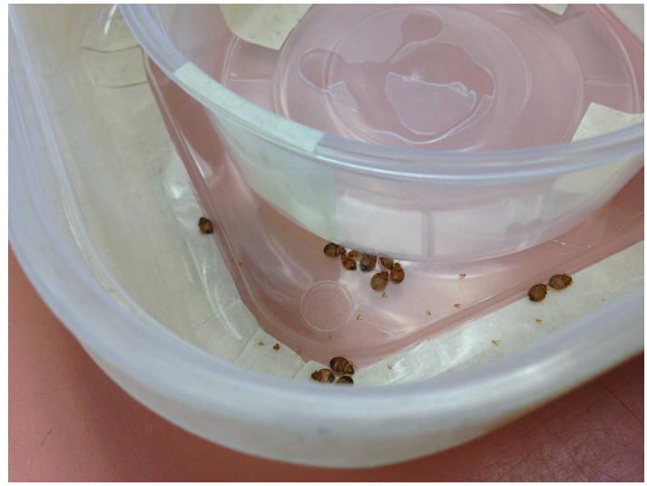
Figure 12. Bed bug interceptor trap with victims.