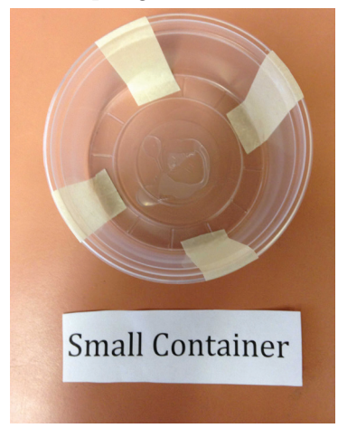
Figure 3. Rough-surfaced tape placed into the small container.

2. Evenly space and firmly press the four pieces of tape vertically on the inside surface of the smaller container to connect the inner top edge with the container bottom.